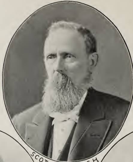
SCOTCH - IRISH